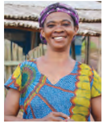
A woman in Asankragwa