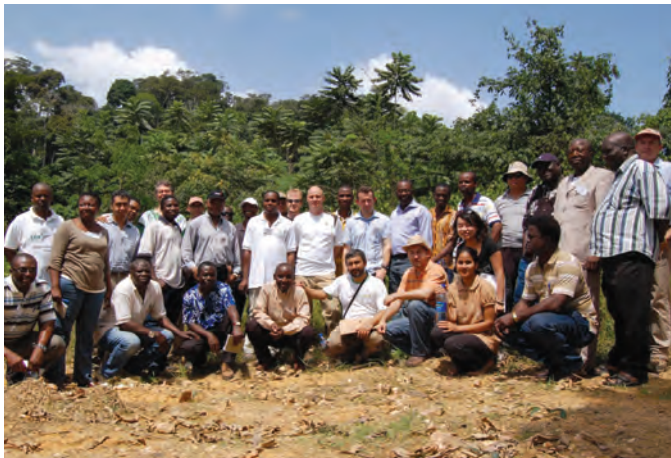
Ghana REDD Readiness Field Team

The next chapter further identifies the key challenges to be addressed during an enhanced phased approach to REDD+.