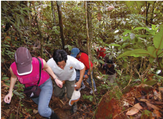
Participants at Ecuador Dialogue Field Trip

Rights to land, trees and carbon. In many regions, disputes over tenure have persisted for generations and it is unlikely that all will be fully resolved in time for REDD+ implementation. In Guatemala, for example, issues related to property rights continue to stand in the way of improved forest governance, 15 years after the end of the civil war there. The fragmented nature of forests and overlapping claims contributes to tension and insecurity over land tenure and ownership.